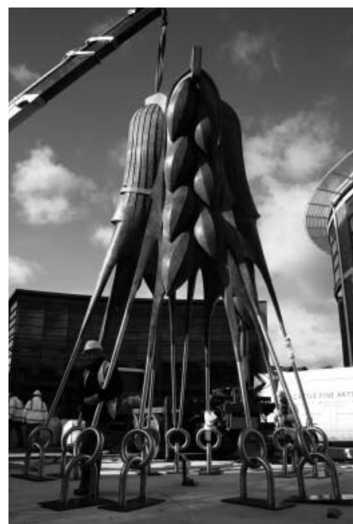
'Steeped Vessels' in Lee

"From my personal point of view I have been able to witness the entire process starting with our artist at work in his studio to preparation of sand casts, casting the bronzes, connecting them together, right through to a very well organised and successful installation in the main square of our Brewery Wharf redevelopment.